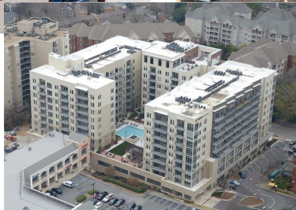
Building for Generations