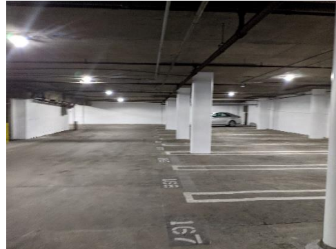
Building for Generations