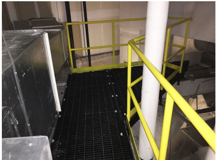
Building for Generations