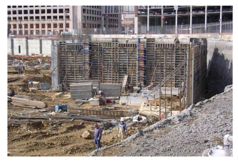
Building for Generations