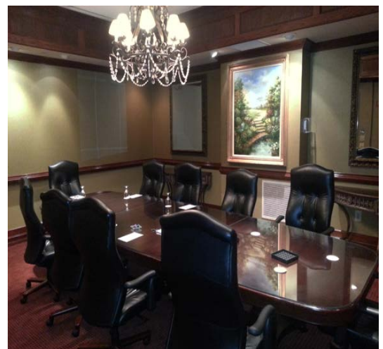
Building for Generations