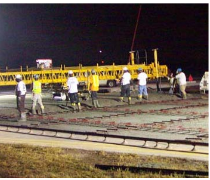
Building for Generations