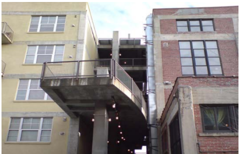
Building for Generations