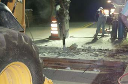
Building for Generations